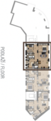
PODLAŽÍ / FLOOR