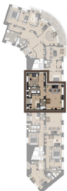
PODLAŽÍ / FLOOR