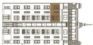
Schéma půdorysu bytu představuje dispozici řešení bytu. Kuchyňská linka a nábytek nejsou součástí dodávky bytu, zařazení je zobrazeno pouze pro názornost. Plocha zahrady je orientační. Specifikace pro konstrukce, povrchové úpravy a rozsah vybavení je předmětem přílohy "Standard nemovitosti".

svoboda&williams | CHRISTIE'S INTERNATIONAL REAL ESTATE