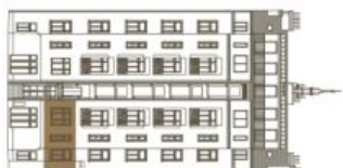
Schéma půdorysu bytu představuje dispozici řešení bytu. Kuchyňská linka a nábytek nejsou součástí dodávky bytu, zařízení je zobrazeno pouze pro názornost. Plocha zahrady je orientační. Specifikace pro konstrukce, povrchové úpravy a rozsah vybavení je předmětem přílohy "Standard nemovitosti".

svoboda&williams | CHRISTIE'S INTERNATIONAL REAL ESTATE