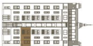
Schéma půdorysu bytu představuje dispozici řešení bytu. Kuchyňská linka a nábytek nejsou součástí dodávky bytu, zařízení je zobrazeno pouze pro názornost. Plocha zahrady je orientační. Specifikace pro konstrukce, povrchové úpravy a rozsah vybavení je předmětem přílohy "Standard nemovitosti".

svoboda&williams | CHRISTIE'S INTERNATIONAL REAL ESTATE