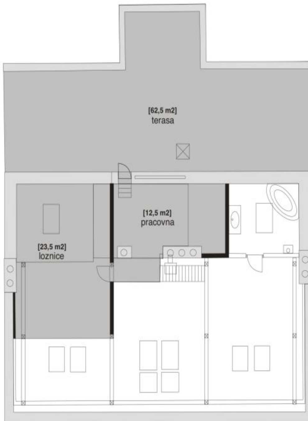
patro s terasou