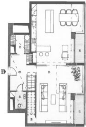
1. PATRO VSTUPNÍ PODLAŽÍ